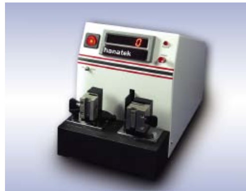
CBT 1 Crease and Board stiffness tester

Profiles the crease forces present during carton converting. Also measures carton opening force and board stiffness.