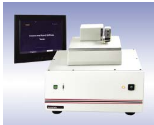
CBT 3 Advanced Crease and Board stiffness tester