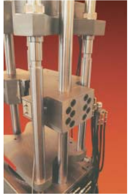
Fig. 4. Close-up of the 120,000 lbf (600 kN) capacity Type AF Super "L" load frame showing the recessed clamping bolts that allow the operator to reposition the lower crosshead if necessary.

Specifications subject to change without notice.