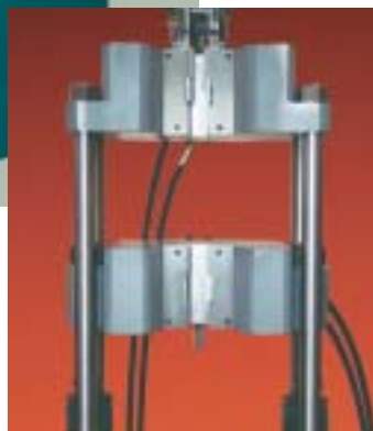
Fig. 5. The 30,000 lbf (150 kN) and the 60,000 lbf (300 kN) capacity standard Super "L" testing machines can be supplied with fully open front crossheads and hydraulically operated lever grips as shown.

For manual control and convenient operation each Super "L" includes as standard a handheld controller with an LCD and an extended cord. A portion of the LCD reads force in either lbf, N, or kgf in 10 mm high numbers. In addition to displaying force, it can be optionally equipped with instrumentation and signal conditioners to display position and strain values. If the position instrumentation (high resolution encoder) and signal conditioning module are ordered, speed will also be displayed.