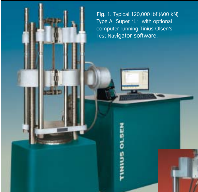
Fig. 1. Typical 120,000 lbf (600 kN) Type A Super "L" with optional computer running Tininius Olsen's Test Navigator software.

Type A models were originally designed to meet the exacting requirements of testing 7 strand cable and feature an open front crossheads to permit rapid insertion and removal of specimens, and this feature has become popular for many other applications involving rapid, repetitive testing. Positive specimen holding is ensured by the wedge action of manually or hydraulically operated lever grips. An adjustable top crosshead and motorized lower crosshead quickly accommodate specimens of varying lengths.