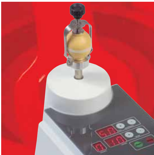
clamping system and integrated glass keyboard