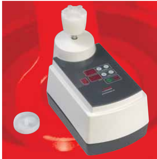
pulverisette 23 with PCR tube container