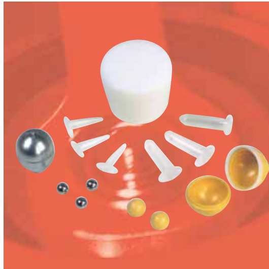
tube container, grinding bowls and balls